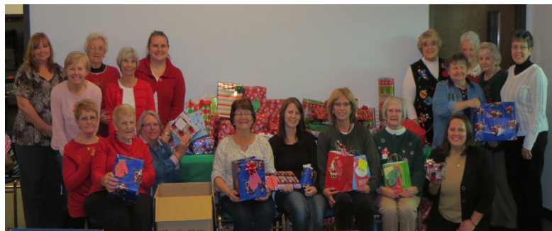
Sisters in Service Salad Sampler gifts for KVC